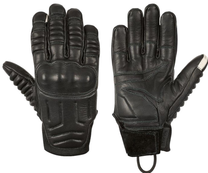
CORA Short Black