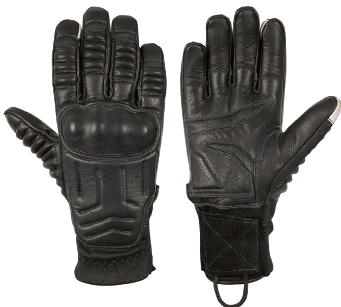
CORA Long Black