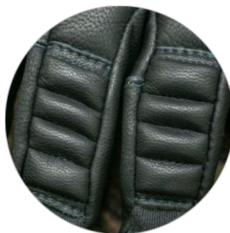
Goatskin leather reinforcement with a shock absorbing PORON® XRD™