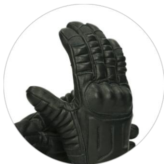
D3O® protector of the knuckles on the back of the hand