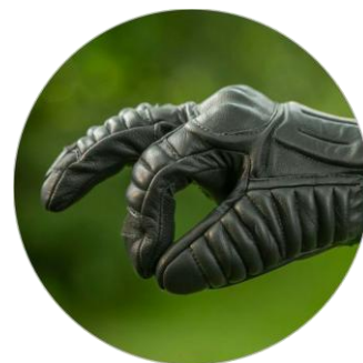
Anatomical and comfortable glove cut