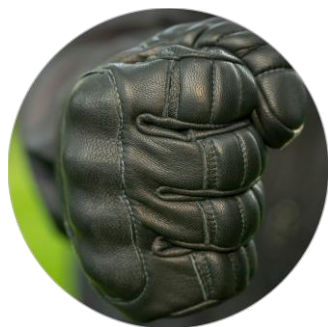
Strong and robust glove construction